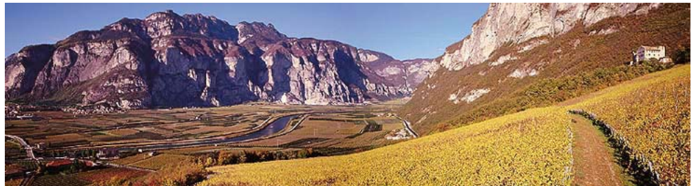
Pian di Castello vineyard and the Adige Valley.

Climate, soil and people are the three roots of quality. San Michele is situated on the protected south side of