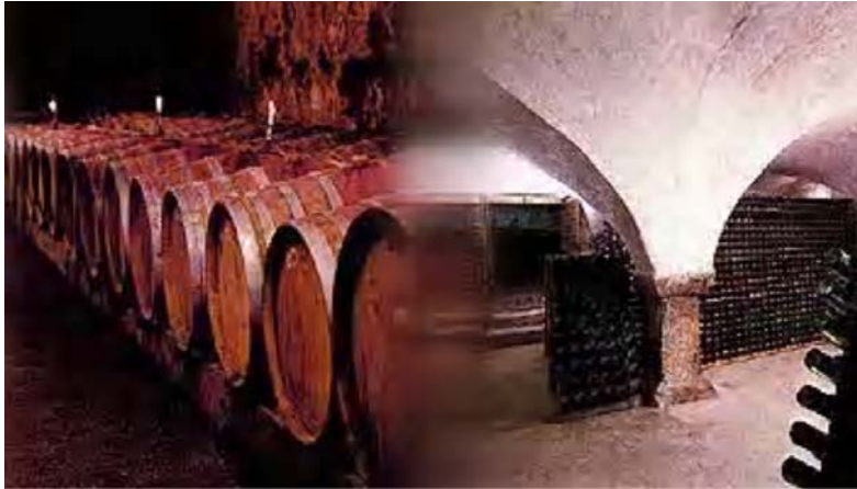
The historic winery from the 15th century where “Endrizzi brut” matures slowly.