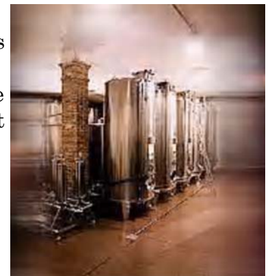
The fermentation area barriques.

But above all, patience and time rule supreme here, because people cannot change what nature offers, they can only bring it to perfection.