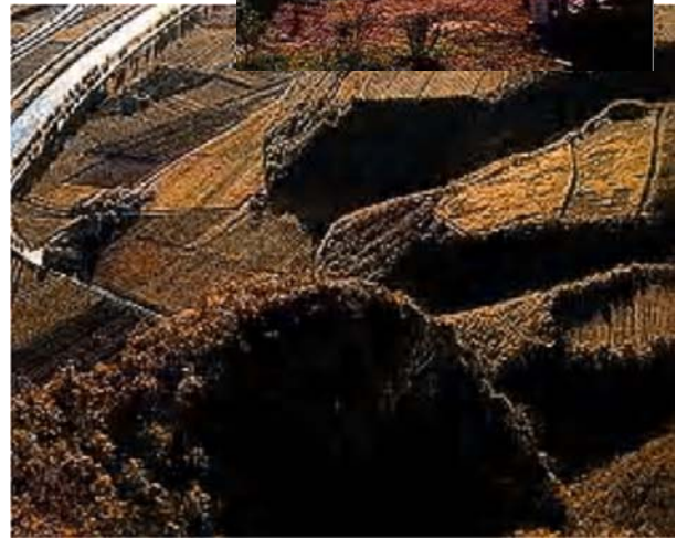
Pian di Castello and Masetto vineyards.