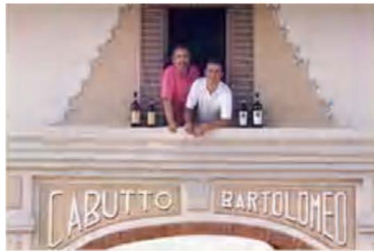
The Cabutto brothers.